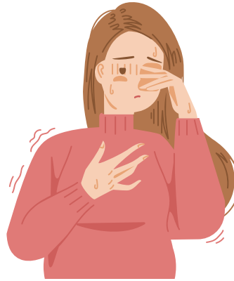
Fatigue or weakness